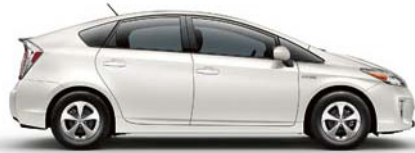
BLIZZARD PEARL (extra-cost color)