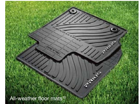
All-weather floor mats 10