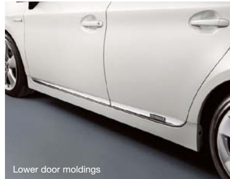
Lower door moldings

Alloy wheel locks First aid kit All-weather cargo mat Hybrid Synergy Drive® window graphic All-weather floor mats 10 Illuminated doorills Ashtray cup Lower door moldings Carpet cargo mat Paint protection film Cargo net — envelope Rear bumper appliqué Cargo organizer Remote Engine Starter Cargo tote VIP Security System 11 Carpet floor mats 10 Door edge guards Emergency assistance kit