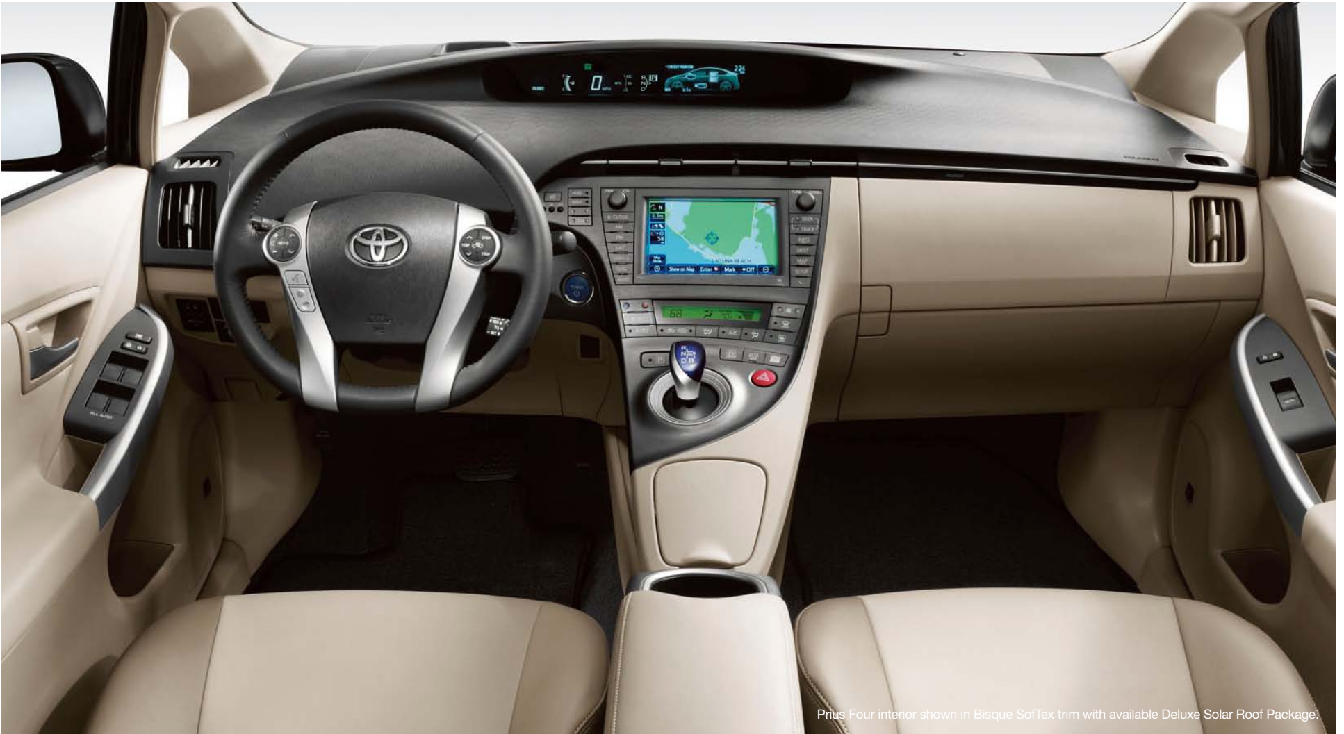
Prius Four interior shown in Bisque SofTex trim with available Deluxe Solar Roof Package!

1. See footnote 2 in Disclaimers section.