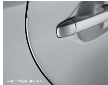
Door edge guards