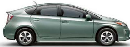
SEA GLASS PEARL