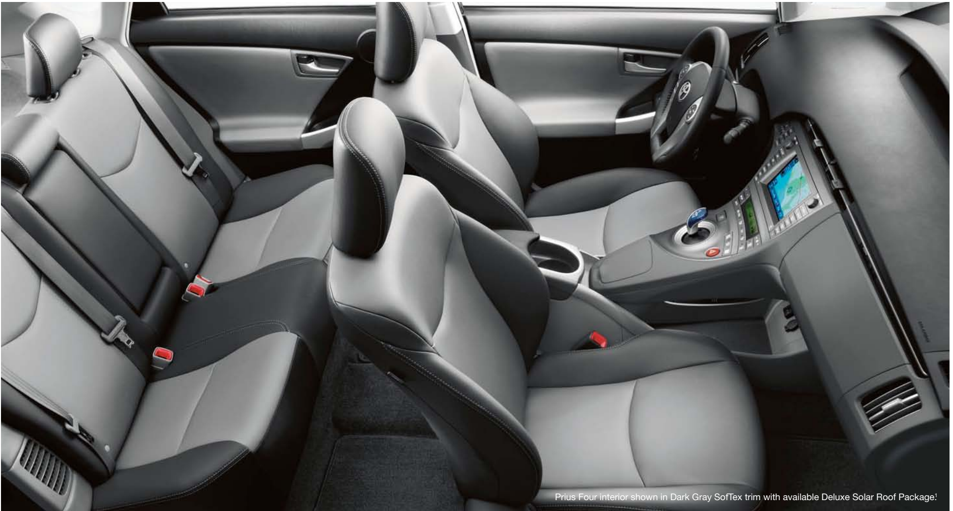
Prius Four Interior shown in Dark Gray SofTex trim with available Deluxe Solar Roof Package!

Getting comfortable is easy, thanks to the available 8-way power-adjustable driver's seat with power lumbar support that lets you find your ideal position.