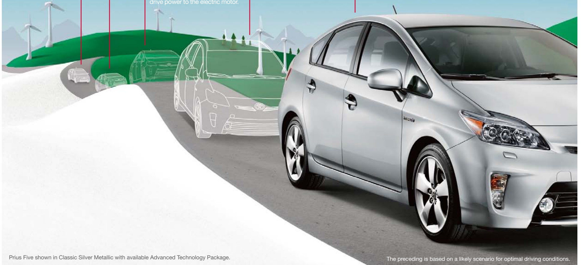
Prius Five shown in Classic Silver Metallic with available Advanced Technology Package.

GASOLINE ENGINE The series-parallel Hybrid Synergy Drive® helps the gasoline engine deliver both power and fuel efficiency.